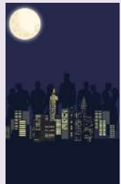
Apr. 24-May 4 COMPANY by Stephen Sondheim and George Furth