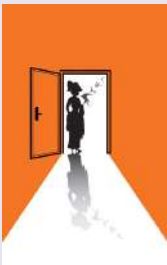
Feb. 20-23 A DOLL'S HOUSE, PART 2 by Lucas Hnath