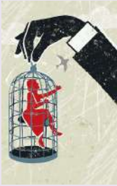
Oct. 3-6 A DOLL'S HOUSE by Henrik Ibsen