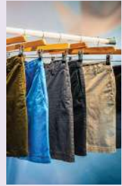
Jan 24-26 SHORT PLAY FESTIVAL by Various Playwrights All Student-Directed