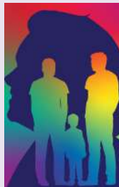
Feb. 28-Mar. 2 MOTHERS AND SONS by Terrence McNally All Student Produced