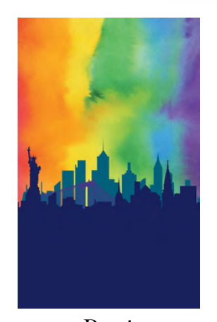
Rent April 25th- May 5th

For moe information on our upcoming shows, and to reserve tickets, please visi our websit: